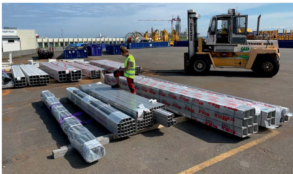
Sverdrup supplied over 2,000 meters of lean duplex hollow structural sections, plates and hot rolled angle bars.

was lean duplex EN 1.4362/UNS S32304 in accordance with NORSOK M:120 – MDS YD37. Sverdrup supplied over 2,000 meters of hollow structural sections, in addition to plates and hot rolled angle bars in lean duplex from its warehouses in Norway.