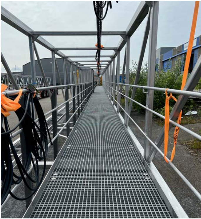
The use of lean duplex instead of carbon steel resulted in a considerably lighter structure while almost eliminating the need for maintenance.