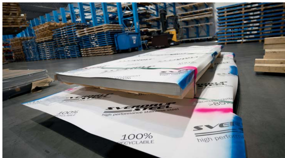
Sverdrup Steels alloys are 100% recyclable and made from at least 85% recycled steel.

company arranges technical seminars and promotes duplexes in close collaboration with its clients. Looking ahead, the company anticipates a bright future for duplex stainless steel in bridges and other marine structures.