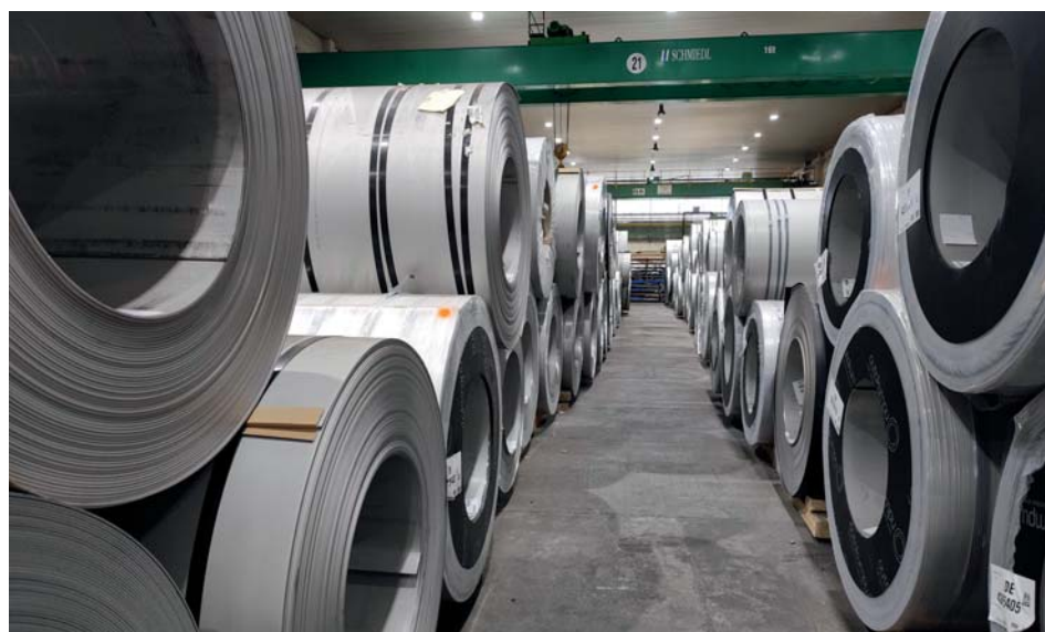
Sverdrup Steels' clients are reassured by the company's high stock levels which guarantee material availability and security of supply.