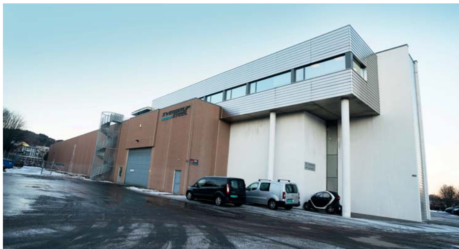
The Sverdrup Steel headquarters is in Stavanger, Norway.